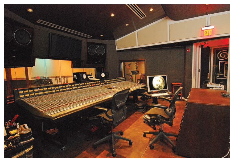
Fig. 1. Interscope Records control room, showing flush-mounted loudspeakers, sloping ceiling, and side soffits.

hears both speakers (interaural crosstalk), a phantom center image is not the same as that heard on headphones. The direct path length from either loudspeaker to one ear is different from that to the other, producing a comb filter with its first dip around 2 kHz. In contrast, a good ensemble of symmetrical lateral reflections spreads out the sweet spot, adds depth to the stereo image, and helps fill in the 2 kHz dip.